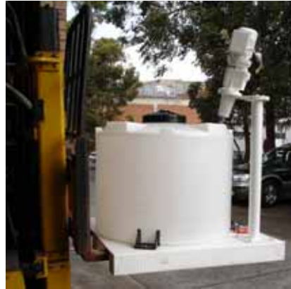
500 litre vessel on pallet for fork lifting and gear driven mixer on a pipe stand