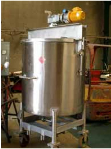
2000 litre stainless steel mixing vessel on castors (wheeled between required locations) and low profile height gear driven mixer with hazardous location motor and VSD.