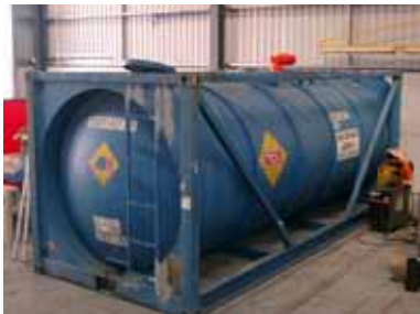
20,000 litre cylindrical stainless steel vessel, built on a 40' shipping container platform, with integrated mixing and pumping systems and electrical panels