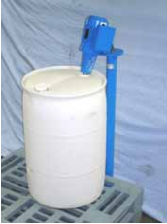
200 litre vessel with direct drive mixer