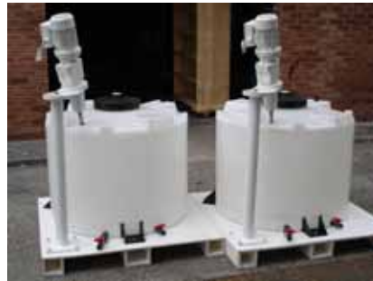
500 litre cylindrical vessels on pallet 200 litre units also available