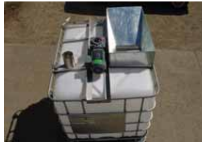
1000 litre vessel with Gear Drive Mixer and powder loading facility (hopper design)