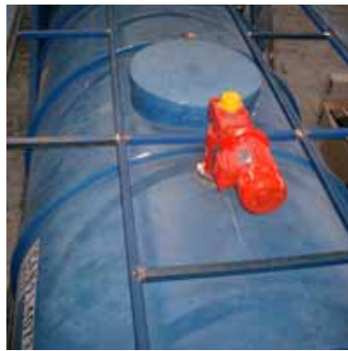
20,000 litre vessel with integrated mixer to suit local or international transportation