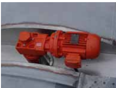
low profile height mixer drive remains inside the transportable vessel and allows multiple stacking