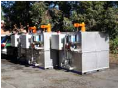
3000 litre cubic stainless steel vessels with integrated mixers, pumping systems, and electrical panels, palletised