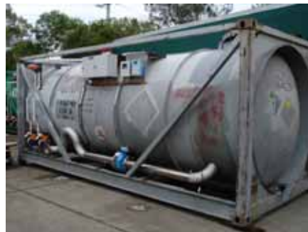
19,000 litre vessel for sea, road or rail transportation with integrated mixer, pumps, and control systems