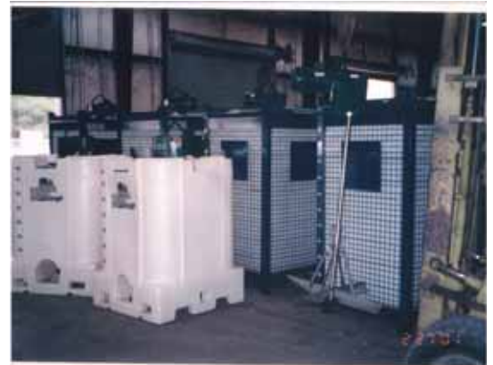
2000 litre vessels cubic vessels on pallets extra heavy duty construction courtesy of MixMaster, SC, USA.