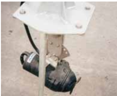
submersible mixer, pole mounted below a galvanised pallet to suit mixing in underground concrete pits