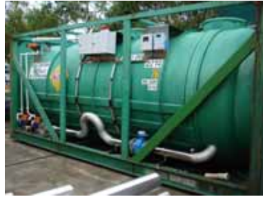
20,000 litre transportable vessel with process integration (mixer, pumps, systems)