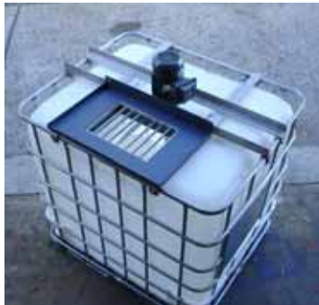
1000 litre vessel with Direct Drive Mixer and powder loading facility (plain design)