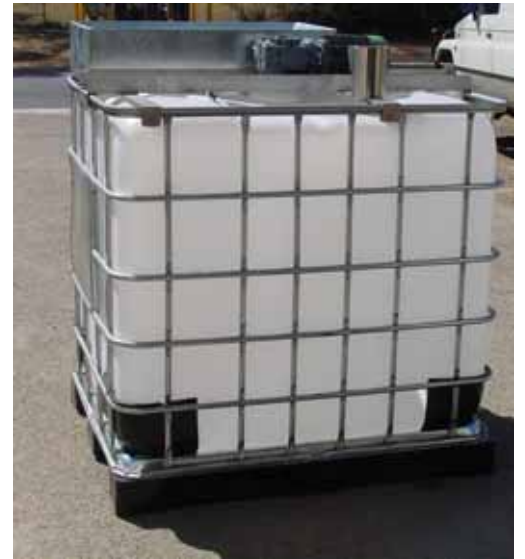
Standardised 1000 litre vessels, palletised, with low profile height mixing system, electrical flex and plug, and plug holder.