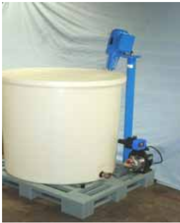
750 litre vessel, palletised, with pipe stand mixer and pump