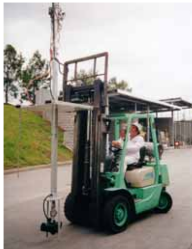
the submersible mixer is adjustable in distance below the pallet, to suit underground pits of varying depth

The FLUID SOLUTIONS range of portable mixers is unlike any other.